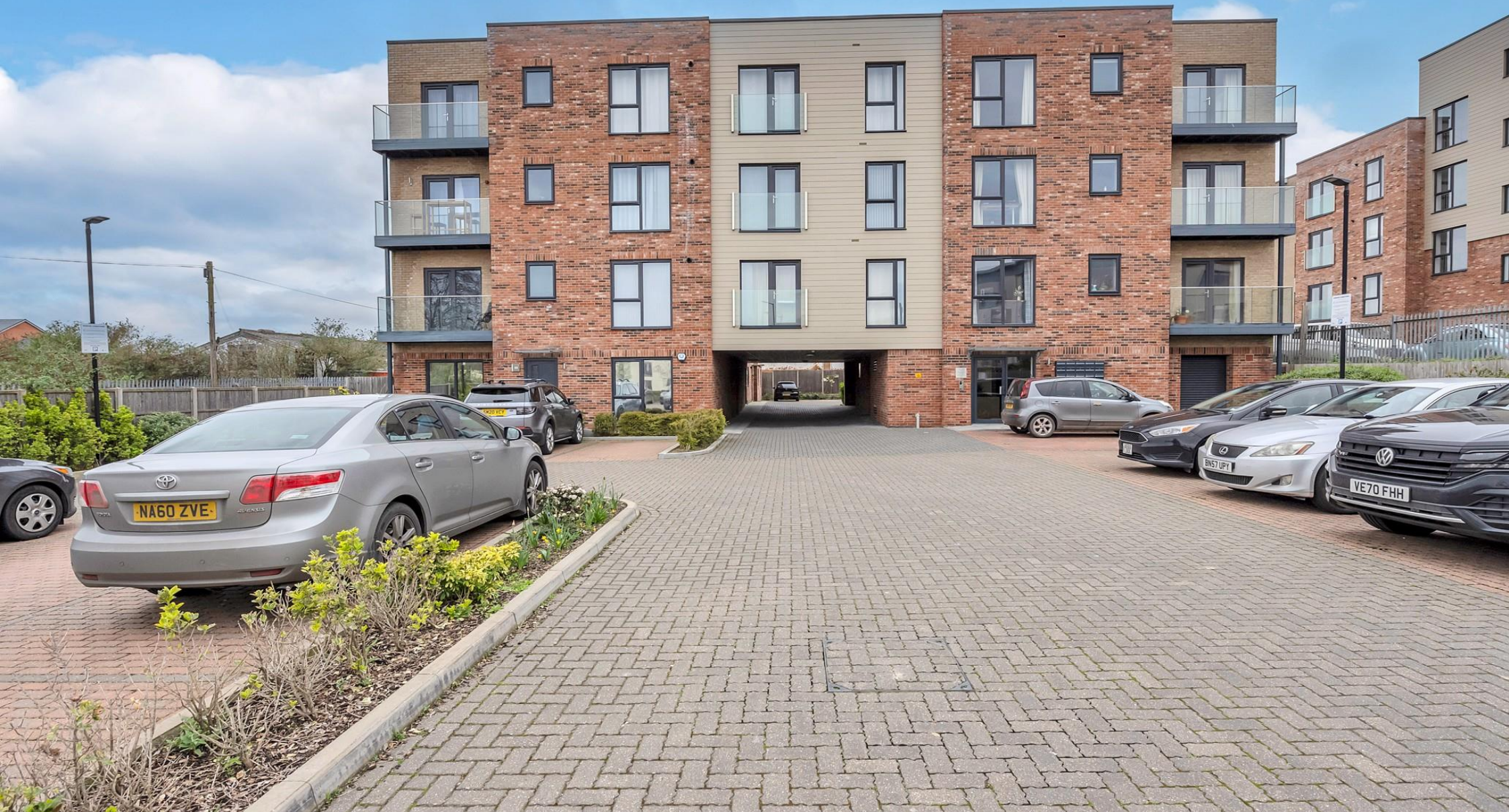
Tamlyn House, Station Hill, Bury St. Edmunds, Suffolk, IP32 6AQ